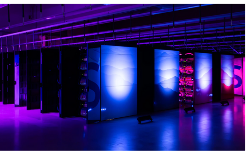
ALPS Supercomputer at CSCS.

(QS World University Ranking: Europe 2025)