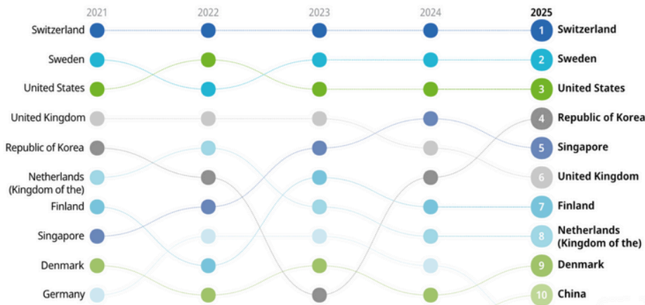
World Talent Ranking, IMD 2025

ETH Zurich – the “Swiss MIT” and Einstein’s Alma Mater – named best university outside of the US and UK (Sources: Times Higher Education World University Ranking 2025, QS World University Rankings)